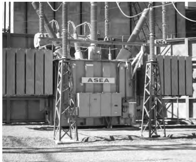
Photos taken at: Zimmer Generating Station (345/69 KV Transformer) Cincinnati Gas & Electric Co., Moscow, Ohio, U.S.A.

Protectowire Linear Heat Detector is a component of a complete family of fire detection systems manufactured by The Protectowire Company.