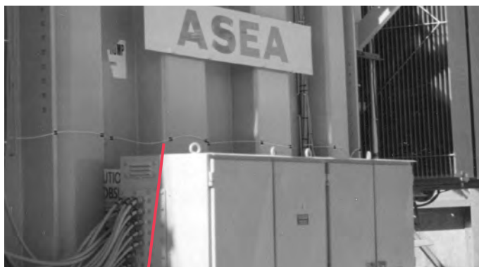
Protectowire Linear Heat Detector