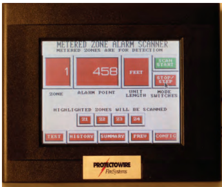
PCLC Graphic Display (2600HD3)