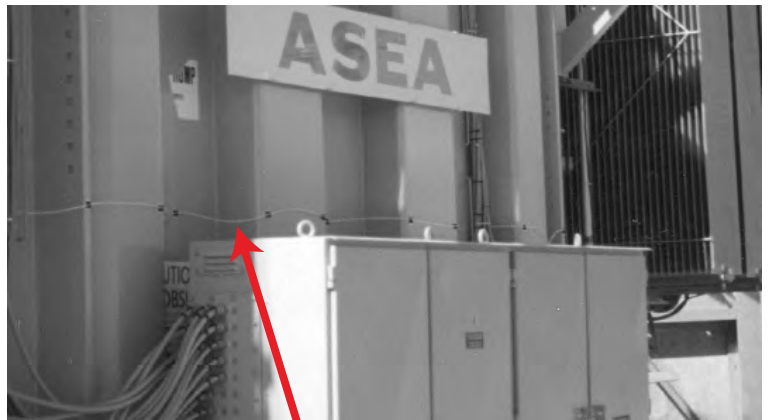
Protectowire Linear Heat Detector