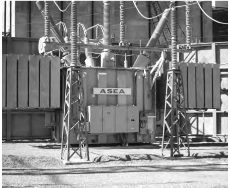
Photos taken at: Zimmer Generating Station (345/69 KV Transformer) Cincinnati Gas & Electric Co., Moscow, Ohio, U.S.A.

Protectowire Linear Heat Detector is a component of a complete family of fire detection systems manufactured by The Protectowire Company.