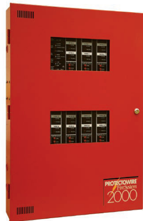
FireSystem 2000 Control Panel